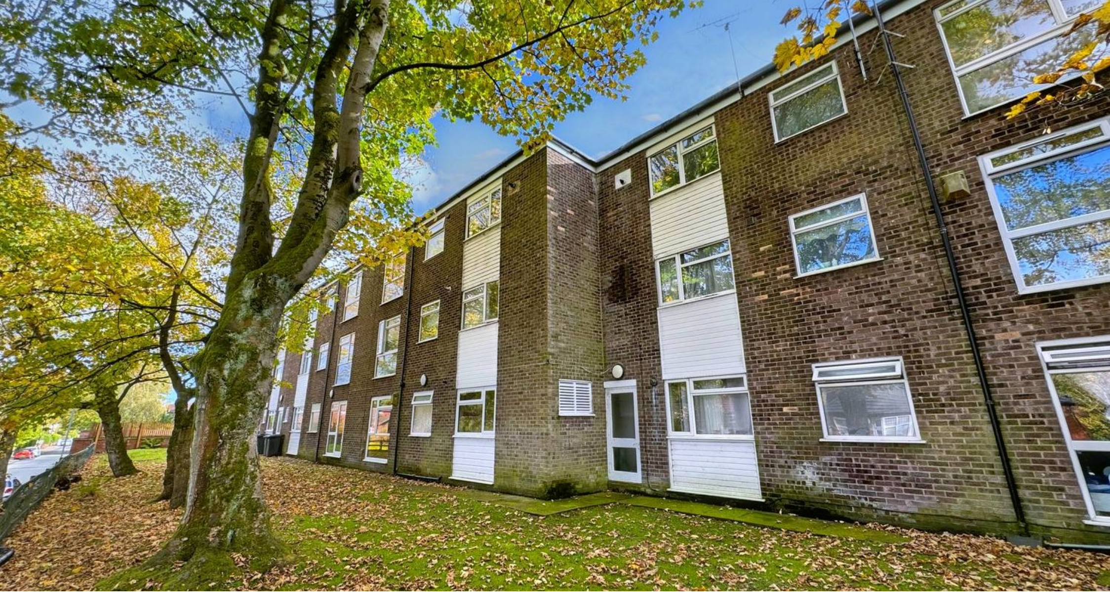
Flat 6, Tall Trees, Salford Salford