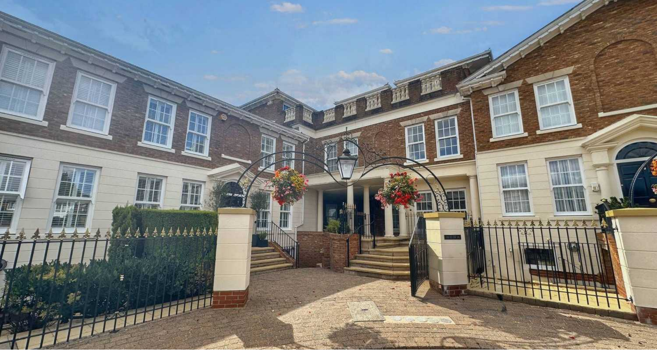
16 The Square, Ringley Chase